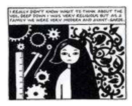
FIGURE 1. From Persepolis: The story of a Childhood. 2003: 6

Therefore, for young Marji wearing the veil develops in her a feeling of alienation from her friends and opposite sex at schools. She is fully cognizant of the fact that the veil, as a national symbol, separates her in copious ways, including body and mind. The first few pages reveal how the veil fragments her mind and identity when she states "I really don't know what to think about the veil, deep down I was very religious but as a family we were very modern and avant-garde" (6). She constantly struggles between her Islamic religion and her French, modern education. The young Marji, therefore, is undecided which to choose. To veil, she demonstrates her support and devotion to the country, and to unveil she would encounter a separation within her country as the women in the society are veiled. The following figure is sketched to show her fragmented mind and identity: