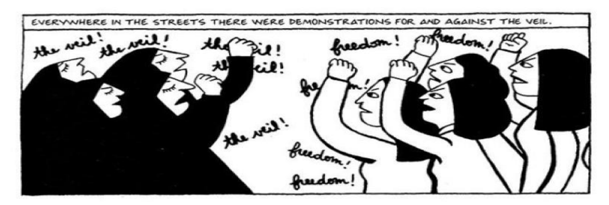
FIGURE 3. From Persepolis: The story of a Childhood. 2003: 5

Satrapi explains that in the Islamic Republic of Iran, the veil became a benchmark with which women are measured. Those who wear the veil are devoted believers and those who do not wear the veil are traitors and westoxificated (Sichani 2007). The veil becomes a site of struggle and division. The author depicts this division of women when she tells the readers about the demonstration that happens after the Revolution. Satrapi shows how on the left side, women are all covered up with black chadors, while on the right hand, women are unveiled (5).