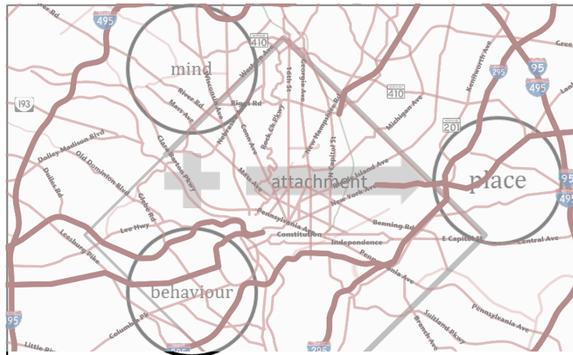
FIGURE 1. The relationship between psychogeography and place attachment

The key components focus on how the poets, as individuals and residents of the city, perceive and respond to the site via their actions, therefore establishing a more established relationship with Kuala Lumpur. They thrive as an investigation of space and the rich history of Kuala Lumpur because of their adventures and discoveries of the city. The poets' way of thinking, as conveyed via their interpretations of their surroundings and activities, transcends traditional perceptions of the place and raises questions about Kuala Lumpur as something more than a physical location. This framework illustrates the psychogeographical process through which an individual forms a personal connection with Kuala Lumpur based on their own perspectives and behaviours. This provides a comprehensive overview of Kuala Lumpur as an urban metropolis spanning several generations and historical eras.