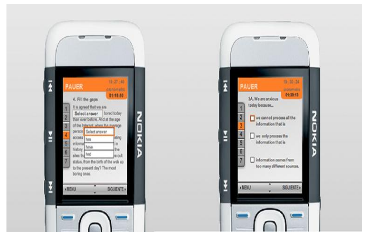
FIGURE 3. Adaptation of the different types of question for ESP testing and m-learning. Multiple choice tasks.