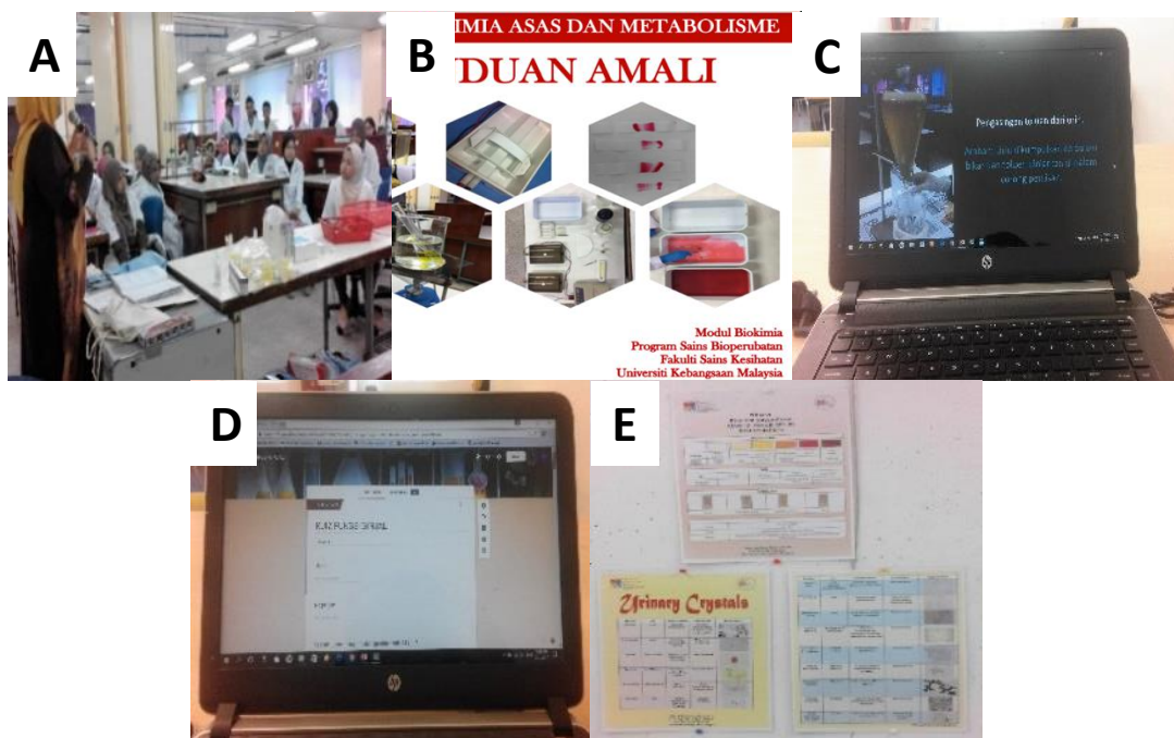
Figure 1 : Components of BioMet-Think Aid. Briefing was given prior to the practical by the lecturers (A). The learning package consists of practical manuals (B), practical demonstration videos (C), quizzes (D) and posters (E).

at the end of each practical session via Google form. The questions were served only as a formative assessment.