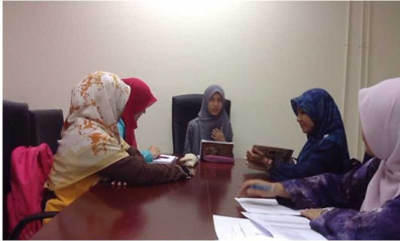
PICTURE 1. Students participating in the OPRA

Oral Progress Report Activity (OPRA) is the third component of the project work which is designed to provide opportunities for the students to explore and use appropriate workplace discourse while practicing communication skills that simulate a workplace setting. OPRA is carried out in a small group meeting-like situation where individual student in a group is required to present the progress of the group project assigned to him or her respectively. One student leads the group discussion while the others report on the progress of the project. Through OPRA, students use English language to discuss issues pertaining to the project, reflect on their actions, and make plans for writing the final report. These skills are reflective of the existing practices in the workplace community. Picture 1 is a photograph of the students participating in OPRA.