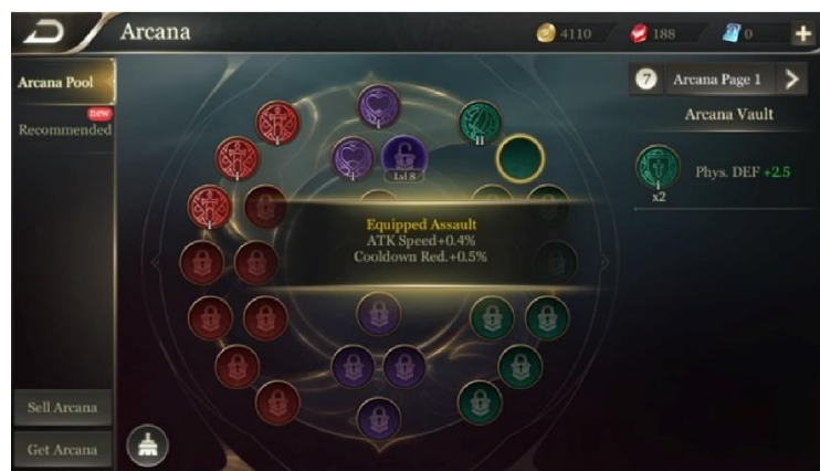
FIGURE 1. Screenshot of Arcana system of ROV

Functional items: This type of items help boost the heroes and directly affect the win-rate and balance of the gameplay. In ROV, players are able to play a trial hero weekly. However, if the players need to get a permanent hero, they need to purchase with real money. Alternatively, the heroes can also be purchased with virtual currency. In addition, there is a temporary boost item that helps players increase virtual money and the player’s experience point. Moreover, ROV provides one feature that formed diversity in the gameplay styles. This feature strengthens the initial abilities of the characters and can be adapted in each type of the character called “Arcana system” as shown in Figure 1.