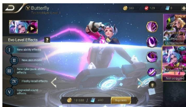
FIGURE 2. Screenshot of Evolution skin features of ROV

Decorative items: This type of items do not affect the gameplay, but they will increase the in-game money rate and the experience point of the player (not heroes). They are solely for appearances (known as skin) in ROV, and players have an option to purchase with real money or from lucky draw. Tencent Games has partnered with DC Comics, one of the largest and oldest American comic book companies that produce iconic hero characters in order to create special heroes and skins (Arena of Valor Guide, 2018). Moreover, there is an evolution skin where a player can experience special animation, effect, and sound according to the tiers system. Players have to accumulate the total evolution points to obtain evolution skins of higher tiers. Also, the evolution skin of each tier comes with their own privileges, as shown in Figure 2.