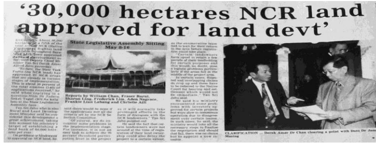
Figure 4: Two examples of news in the human development and physical development categories.

The education category was ranked as the fourth highest in frequency (7.3%) among 18 new categories on Sarawak Malays in TST and The Sunday Tribune. Most of the news in this category highlighted the success and achievements of the Sarawak Malays mainly in public examinations and the opportunity to pursue higher education (Figure 5). Although ranked fourth highest, the news reporting on education involving the Sarawak Malays is considered relatively low. The education news show the competitiveness of the Sarawak Malays and their involvement in education related activities.