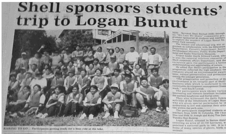
Figure 5: An example of news on education

The education category was ranked as the fourth highest in frequency (7.3%) among 18 new categories on Sarawak Malays in TST and The Sunday Tribune. Most of the news in this category highlighted the success and achievements of the Sarawak Malays mainly in public examinations and the opportunity to pursue higher education (Figure 5). Although ranked fourth highest, the news reporting on education involving the Sarawak Malays is considered relatively low. The education news show the competitiveness of the Sarawak Malays and their involvement in education related activities.