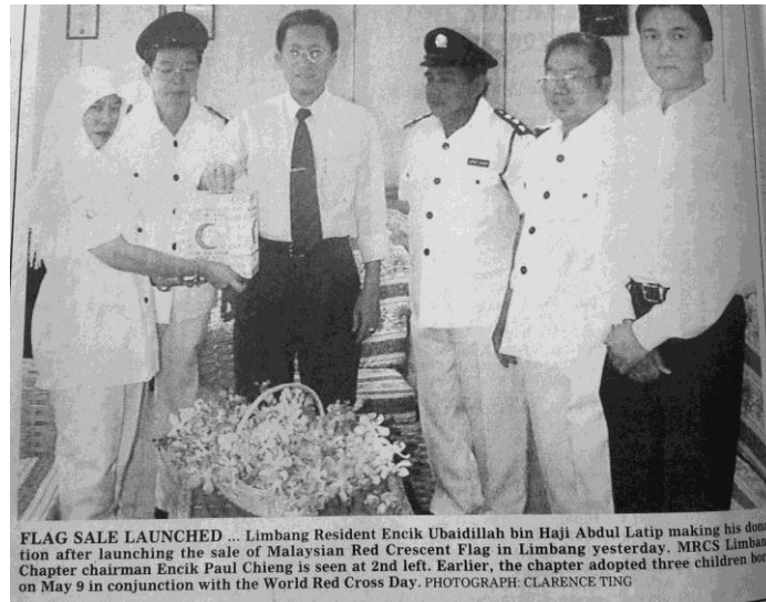
Figure 2: An example of community activity news

From the findings, it shows that Sarawak Malays valued community activities. At the same time, from the perspective of media agenda, such news is given priority by the editors to promote a harmonious society in Sarawak.