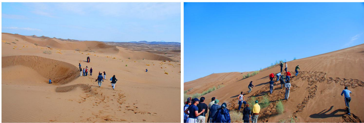
Figure 2: Tourists in Maranjab Desert, Kashan.