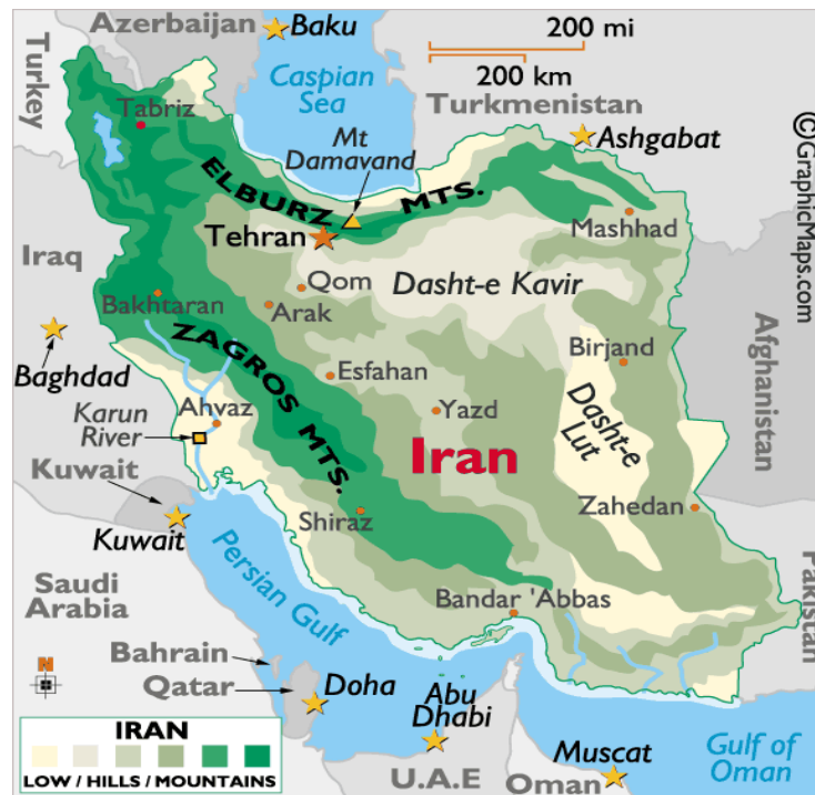
Figure 1: The Republic of Iran

sand in motion like sea waves. At times, this phenomenon forms long sand hills of 40m high. From structural point of view, Dasht-e-Kavir is very much different from Kavir-e-Lut. The difference of temperature between days and nights during a year in Dasht-e-Kavir is between 0 and 70 degrees C.