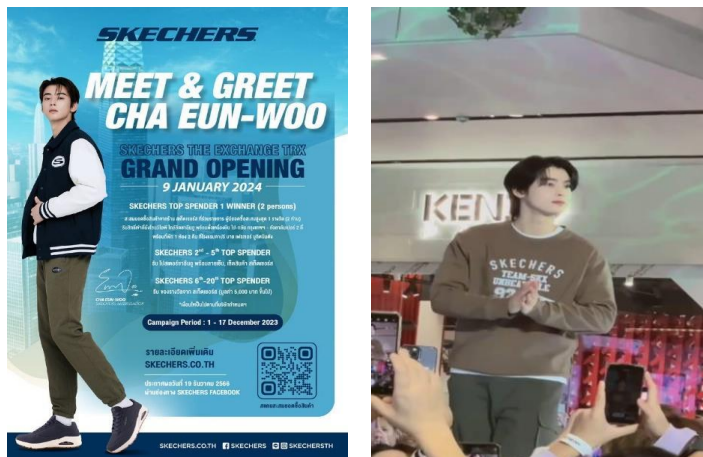
Picture 5 and 6. Promotional poster for the event and Cha Eun Woo on the day of the event.

Photo 6 and Photo 7 was challenging due to the overwhelming presence of fans and attendees eager to glimpse the celebrities. Lastly, Picture 8 showcases post-event promotional content from Longchamp's TikTok account, demonstrating the ongoing digital marketing strategies employed to sustain audience interest following the events.