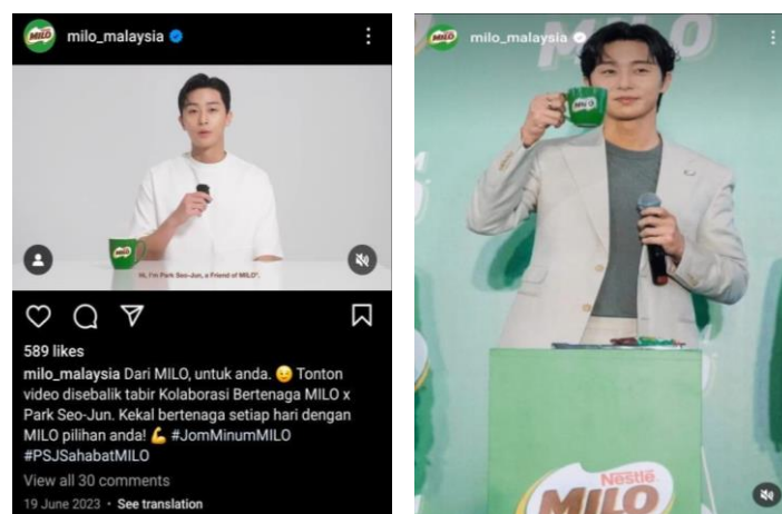
Picture 3 and 4. MILO official Instagram account postings

Another well-known brand that has enlisted South Korean celebrity as official ambassador is MILO. The popular malt drink has chosen Park Seo Joon for their Jom Minum MILO campaign, labelling him as a friend of MILO in an energetic collaboration. They began by releasing short videos on social media accounts, featuring the tagline “Jom Minum MILO” by Park Seo Joon, which created a lot of excitement among fans. Having one of the famous Hallyu heartthrob endorsing something close to their life definitely create a lot of joys among the fans. When Milo announced that they would hold an event with Park Seo Joon at Sunway Pyramid Mall in Malaysia and issued tickets based on the purchase of certain MILO products (specifically, the 3 in 1 MILO packets), fans flocked to the malls to make purchases and only a select few were able to obtain tickets. However, this did not deter thousands more fans from coming to the event location on that day just to catch a glimpse of Park Seo Joon and witness him making and tasting MILO in front of thousands screaming fans. The two photos below from Milo_Malaysia, dated 19 June 2023 and 15 June 2023, summarise the promotional collaboration and highlight the exclusive eBook associated with this partnership. Both posts include the hashtags #JomMinumMILO and #PSJSahabatMILO.