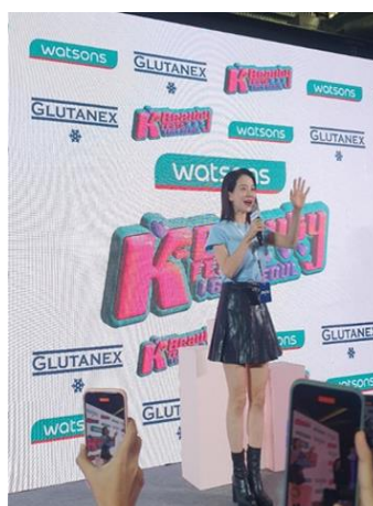
Picture 2. Song JiHyoo at Watson Kbeauty Fiesta

Attendees at the event were exposed to various brands and their products, resulting in a notable increase in brand awareness, engagement, and product sales during and after the event. Additionally, Song JiHyoo had already started promoting the products on her social media accounts months before the events, raising awareness among her followers about the brand, products and how she uses them in her daily routine. For example, in Picture 2, there is a screenshot of the actress on her Instagram Reels from 17 August 2022, promoting the Glutanex soap. In addition to the caption, she included the hashtags #GLUTANEXSOAP and #Glutathianesoap, along with #AD to indicate that this is an advertising post, as she is endorsing the brand. Closer to the event, she began sharing her whereabouts in Malaysia and leaving comments to further excite fans before and after attending the event. This further strengthens the argument of not only receiving information on celebrities on daily basis is a part of fans' everyday practices hence, the attachment to celebrities is stronger and definitely a major factor in the power of the Korean wave.