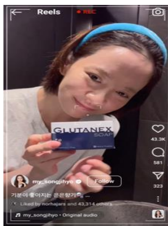
Picture 1. Song JiHyoo posting using Glutanex on her social media account

In the case of Glutanex, a South Korean skincare brand, they collaborated with Watson Malaysia to host the Watson Kbeauty Fiesta in Kuala Lumpur for two days. While Glutanex was the main focus of the event, South Korean beauty brands were also included. The main goal was to generate sales of beauty products by providing attendees with a full experience of Kbeauty, and also by bringing the official brand ambassador, actress Song JiHyoo. Having a popular Korean female celebrity endorse a skincare brand significantly increased brand visibility and attracted a large audience. The event not only drew Song JiHyoo's existing followers but also fans of South Korea's skincare. Importantly, social media played a crucial role in promoting the event. Almost all of Watson's official social media accounts and Song JiHyoo's posts about the event generated substantial engagement, including likes, shares, and comments.