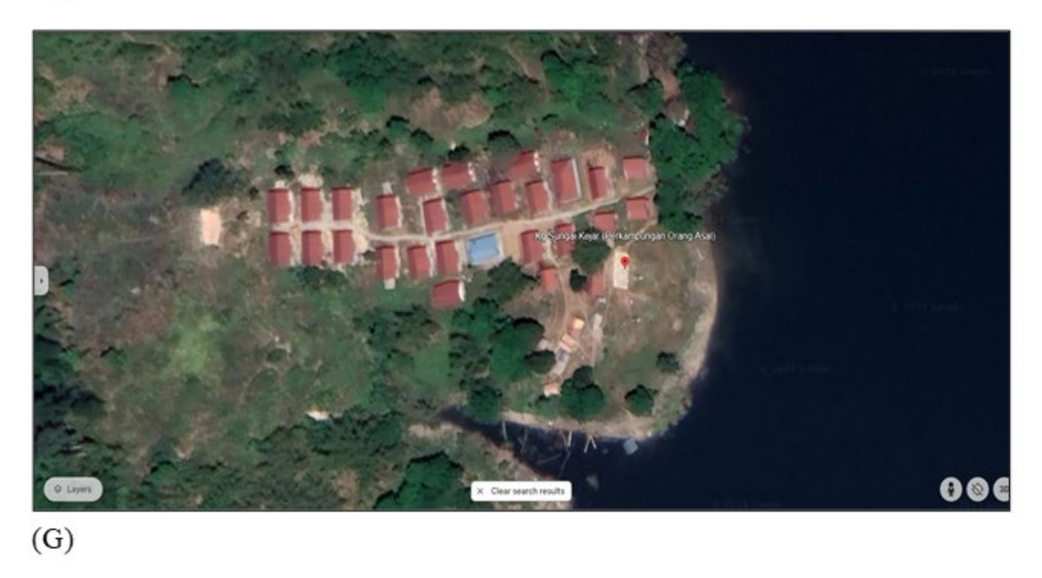
Figure 2. (A) – (E) The photographs from the June 2024 field trip to Pulau Banding Public Jetty document a survey on tourists' involvement in ecotourism development at Royal Belum State Park (RBSP). The images also include satellite views of potential sampling locations within the RBSP, specifically Kampung (Kg.) Sungai Tiang (F) and Kampung Sungai Kejar (G).