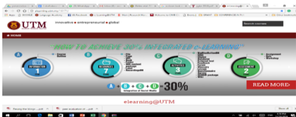
FIGURE 1. Screenshot of the main interface of UTM e-learning system

The e-learning system in Universiti Teknologi Malaysia (UTM) (Figure 1) has been developed since the 1980s to provide a new learning atmosphere for students (Koharuddin et al., 2003) in which a faster, collaborative and interactive engagement between student-teacher and student-student are fostered. The UTM e-learning allows a virtual place for uploading materials, slides, assignments, and is an interactive environment for sharing knowledge and discussions. Studies have been conducted to assess the acceptance of e-learning among lecturers and students of UTM (Masrom, 2007; Razak, 2010), the effectiveness of e-learning in the process of teaching and learning (Norliza, 2010; Rizka, 2009; Yahya, 2009) and the satisfactory level of students using the e-learning system (Al-rahmi, Othman & Yusof, 2015; Razak, 2010). Essentially, the system allows students to upload assignments in any format compatible to the system such as video files, pdf files and text files. It also provides a synchronous and asynchronous communication platform for students to interact between teacher-student or student-student. Essentially, the system allows the usage of peer feedback to learn public speaking skills. Figure 1 below shows the main interface of UTM e-learning system.