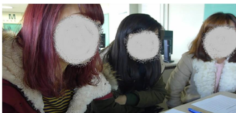
FIGURE 3. S1's arm folding during the second collaborative corpus consultation

The gesture may carry varied meaning, but it mostly suggests negative attitude towards the situation (e.g., Kumar, 2012). Considering the fact that S1 did not show such a gesture during the first session, S1's arm folding in the second session seemed to suggest that her reluctance and passiveness developed throughout the two collaborative group work sessions. In addition, as shown in Figure 3, S2 was keeping her hands down throughout the second session, hinting at a lack of willingness to gain access to input devices (keyboards and mouse). It seemed that S1's left hand position gave S2 some disadvantages, which was a stark contrast with S3 in the first session who constantly attempted to lead the data search process by obtaining control of the mouse and the keyboard (see Figure 2). Due to the close centered angle of the camera to S1, Figure 3 did not show S3's hands, but it was evident that S3 was taking control over the computer as S1 was folding her arms and S2 was putting down her hands below the table. Compared to the initial stage of the collaboration, S3 gained dominant control over the search process after the two group corpus analysis sessions, while the other members became reluctant in contributing to the group work, and S1 in particular seemed to be gradually marginalized from the learning process.