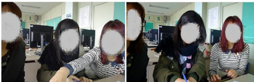
Note. The students' faces were erased to protect their anonymity.