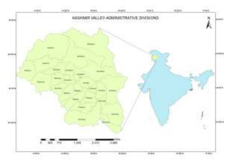
Figure 2. Administrative divisions of Kashmir Valley

In the present study, tehsil has been taken as a unit of study. There were 22 tehsils of 6 districts in the valley in 1981 which are taken as study units. Although in 2001 number of tehsils rose to 26 as tehsil Guraze was separated from Bandipora, Pattan from Baramulla, Kagan from Ganderbal and pampor from Pulwama but this addition has been ignored for the purpose of uniformity with that of 1981 (Figure 2).