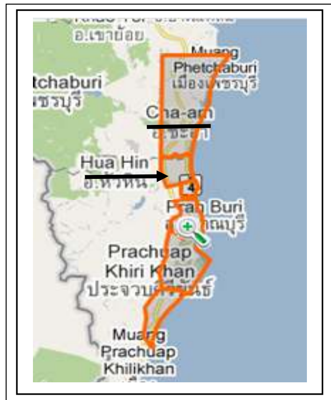
Figures 1. Location of Hua Hin and Cha-an