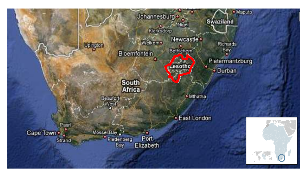
Fig. 1. Location of study

The former British protectorate has had a turbulent, if not particularly bloody, period of independence with several parties, army factions and the royal family competing for power in coups and mutinies. The position of king has been reduced to a symbolic and unifying role. Constitutional government was restored in 1993 after seven years of military rule. In 1998, violent protests and a military mutiny following a contentious election prompted a brief but bloody intervention by South African and Batswana military forces under the aegis of the Southern African Development Community. Subsequent constitutional reforms restored relative political stability. Peaceful parliamentary elections were held in 2002, but the National Assembly elections of February 2007 were hotly contested and aggrieved parties disputed how the electoral law was applied to award proportional seats in the Assembly. In May 2012, competitive elections involving 18 parties saw Prime Minister Motsoahae Thomas Thabane form a coalition government - the first in the country's history - that ousted the 14-year incumbent, Pakalitha Mosisili, who peacefully transferred power the following month.