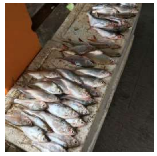
Figure 1: Variety of freshwater fish sold in Lenggong's wet market

"...we have plenty of rivers here, such as Sungai Perak, Sungai Temelong, Sungai Lenggong, Sungai Kuak. These rivers have a lot of fish, the famous tengalan fish, loma fish which cannot be found in other rivers except in Perak. Tengalan fish can be found elsewhere but it will be different, most of the loma fish are in Hulu Perak district..." (Authority 1).