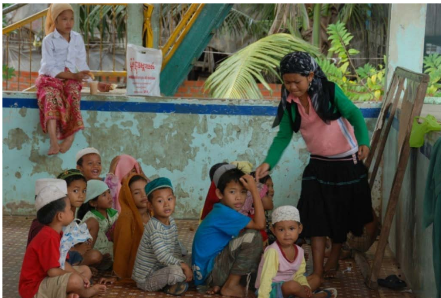
A young girl teaching some younger ones in Norea, Battambang

Imam Musa started to teach the translation and interpretation of the holy Koran to the his wife's village folks, old and young, men and women. Classes of Koran translation and hadith were conducted almost every evening between Maghrib and Isha prayers. During day time, he trained those pursued their full time Islamic studies. The number of his students was growing as time passed. And only when they were qualified, Imam Musa appointed them to be teachers and sent them to other Cham villages along the Mekong river. Through his diligence, up to 1970 when the Cambodian civil war broke out, he managed to train only a handful of them. Some had obtained scholarship to pursue their religious education abroad. This method of teaching where a more knowledgeable student is allowed to teach the younger ones is still in practiced today.