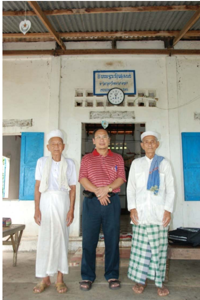
Two Muslim Bani and Me

and now also known as Cham Tujuh . 20 The Murni Muslims, as the name suggests, practises orthodoxy Islam. They are more open to changes and progresses compared with the Bani . It is the people of the Murni group who sent their children to pursue Islamic studies in foreign and distant lands such as countries in West Asia. As for the Bani , both Bani of Vietnam and Cambodia, they are a community who has been destroyed and do not know how to change their nature ( E. Aymonier 1890: 146).