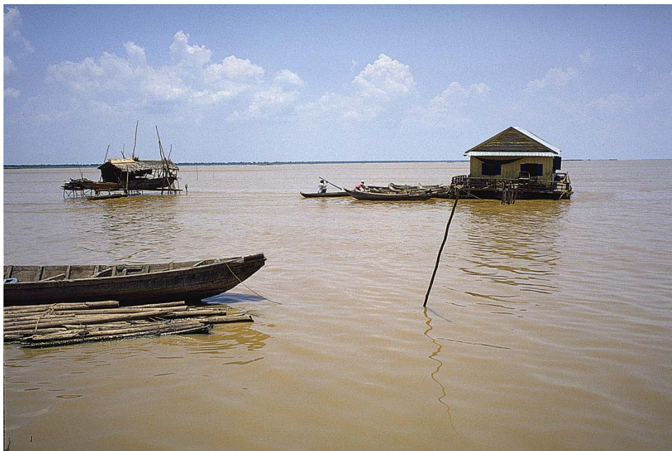
A floating Surau in Choeung Khnéas village, Siemreap