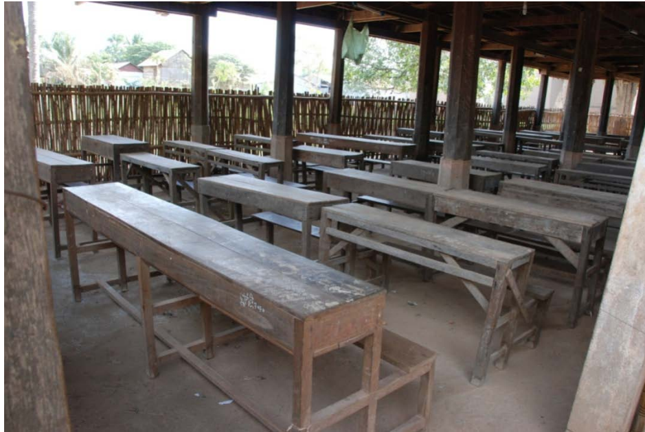
A class room under a house in Svay Khleang