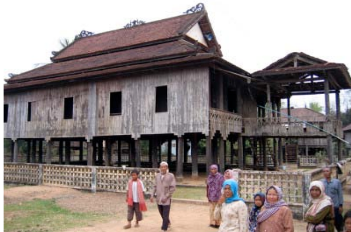
A mosque in a village of the district of Krauch Chmar, Kompong Cham.