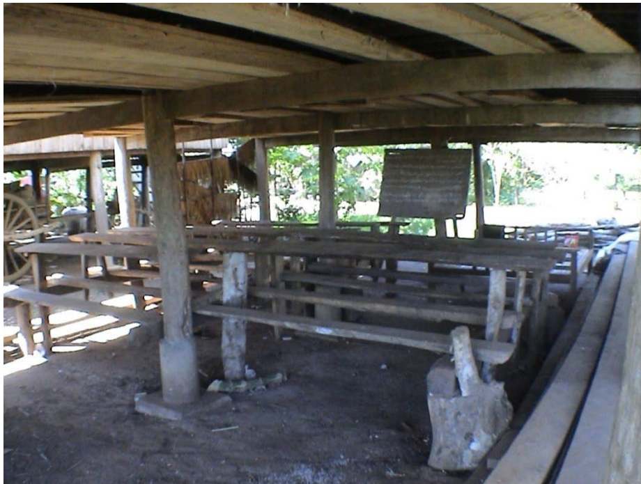
A class room under a house in Dang Kambit, Kompong Cham

Despite of all harassments by his foes, the poor infrastructure of the areas along the Mekong river and most of all the shortage of fund, he managed to set up pondok , one after the other, in various villages where there were his followers. These schools were nothing more than a few tables and long wooden benches set up under some houses, especially the imam's house. In some villages, classes were conducted in surau or masjid as the Kaum Muda followers are majority. Beside those so-called pondok , the first religious school was built in Phum Khbop, Khum Svay Khléang in 1968. The building of this school could not be completed as the Cambodian civil war, a spill over of the second Vietnam War, has started in 1970.