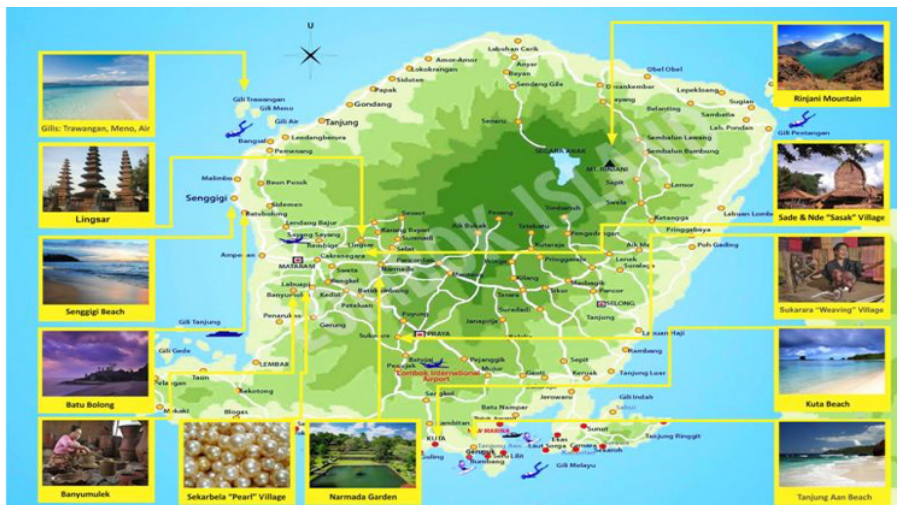
Tourism Map of Lombok Island

Tourism activities that can be done in Gili Trawangan based on the land use regulations written in Governor Decree NTB No. 500 in 1992 are swimming, boating, sailing, wind surfing, game fishing, water skiing, diving, snorkelling, agro-tourism (pearl cultivation), and touring around the Island with cidomo . Most of the tourists coming to Gili Trawangan are domestic and foreign tourists for sight seeing and recreational purposes.