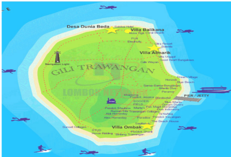
Gili Trawangan Island, North Lombok

The total number of population in Gili Indah Village is 5, 113 people, spread in three backwoods with total neighborhood association (RT) of 17 and total chiefs of households of 1333. The population is made up of 3.064 males and 2.049 female.