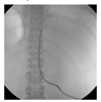
Fig 3: The tip of the dual-lumen catheter placed in the upper inferior vena cava.

Access to the central venous circulation for hemodialysis has traditionally been performed via the