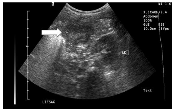
Figure 2: Showing a mass with reniform appearance, with a central hyperechoic region surrounded by a hypoechoic region, is located anteromedial to the normal appearing left kidney (white arrow).

The cause of pica is unknown but multi-factorial etiology is suggested. Some causes include iron deficiency, psychological factors like: poverty, maternal neglect and abuse, lack of parental supervision, disorganized family situation, mental retardation, autism and brain behavior disorders like Kleine-Levin syndrome (24 -27).