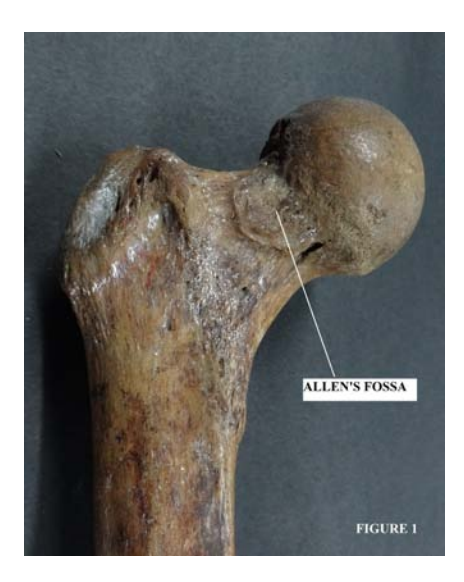
Figure 1: Allen's Fossa in right male femur in anterior view