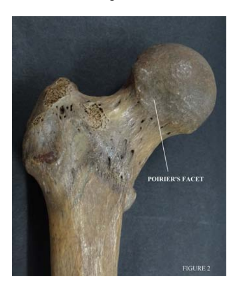
Figure 2: Poirier's Facet in right male femur in anterior view

of femur. Its lateral limit may be formed by a tubercle, which is the medial limit for the groove for obturator externus (4).