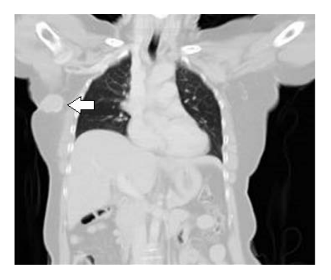
Figure 2 : CT scan showed heterogenous lesion at the right axilla with no evidence of distant metastasis (arrow).

Histopathological examination confirmed the diagnosis of leiomyosarcoma (Fig. 3).