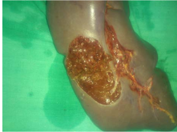
Figure 2: Splenectomy Specimen showing laceration near hilum.

Histopathological analysis of the resected spleen did not reveal any pathology. The postoperative general blood picture showed microcytic hypochromic RBCs