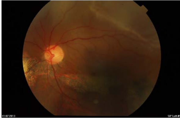
Figure 1: Left fundus photograph showing superior rhegmatogenous retinal detachment involving the macula

emphasizes the importance of patient counselling as to the symptoms of retinal redetachment and the need for immediate presentation even after surgery has already been performed previously.