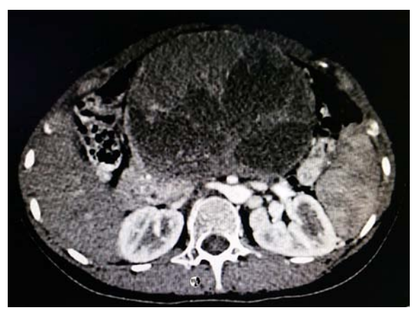
Figure 1: Computed tomography showed pancreatic lesion with mixed solid cystic component involving the body and tail of pancreas likely represent solid pseudopapillary tumour with left sided portal hypertension.