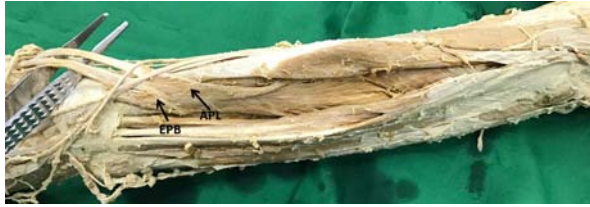
Figure 3: Dissection of left forearm showing the attachments of abductor pollicis longus (APL) and extensor pollicis brevis (EPB).