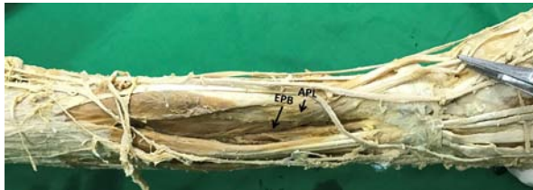
Figure 4: Dissection of right forearm showing the attachments of abductor pollicis longus (APL) and extensor pollicis brevis (EPB).

tendons (8). Mansur et al. have reported nine tendons (2). Rayan and Mustafa have reported a case of unusual insertion of additional APL tendon into a variant thenar muscle (9). The most common site of insertion of additional tendons was found to be on base of first metacarpal bone followed by trapezium, abductor pollicis brevis, opponens pollicis, and carpo-metacarpal joint (5).