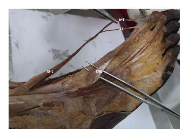
Figure 2: Dissection of the dorsum of Right Foot showing the tendinuous insertions (Lateral view).

(EHL: Extensor Hallucis Longus; EHB: Extensor Hallucis Brevis; AT: Accessory tendon of Extensor Hallucis Longus; MT: Main tendon of Extensor Hallucis Longus)