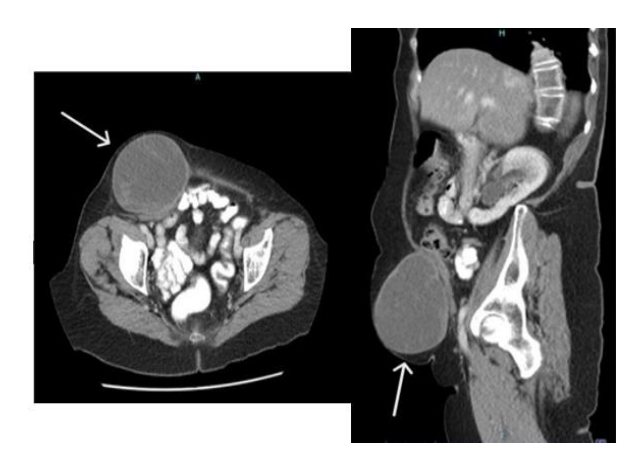
FIGURE 1: A contrasted enhanced CT of the abdomen and pelvis showed a large subcutaneous cystic lesion at the anterior abdominal wall

A contrast-enhanced computed tomography of the abdomen pelvis was then performed and revealed a subcutaneous cystic lesion consistent with seroma, with no intraperitoneal communication or recurrent hernia (Fig. 1). She was initially treated with bedside aspiration. However, the seroma was recurrent.