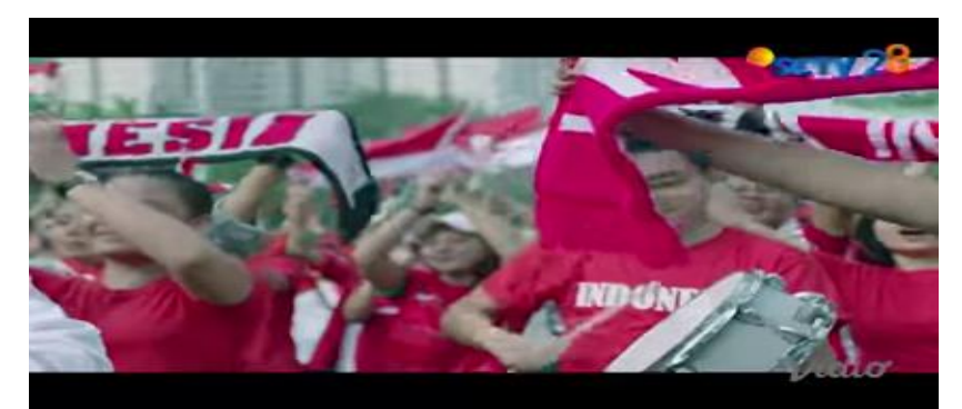
Image 4: A crowd of supporters in the 2018 Asian Games Opening video.

In general, Image 4 merely portrays a crowd. Even so, how does myth read into this? The mythical relation between Jokowi and PKI perceives this as something not unlike a mass protests held by the Indonesian Farmers' Front ( Barisan Tani Indonesia – BTI) or Gerwani during PKI's heyday prior to the 1965 incident.