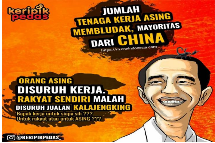
Image 5: Jokowi meme with the foreigner's lackey myth. Translate: (Up) The amount of foreign workers thriving, majority from China (Down) Foreigners told to work. Our own people told to sell scorpions. Who do you work for, Sir??? For the people or foreigners???

The foreigner's lackey myth gained significance with the advent of capital from China to build infrastructure. The sentiment of Jokowi as a foreigner's lackey can be traced back to various meme on social media, in which one of them is shown here in Image 5.