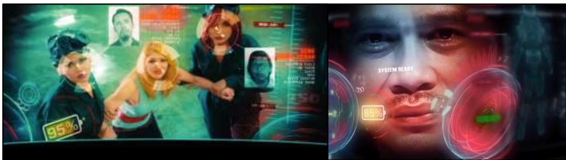
Figure 2: Super Bro Point of View Using a Futuristic Technology Interface in Cicakman 3 (2015)

Cicakman (2015) features two CGI characters using DVFX in some of the scenes in the film. The characters of Cicakman and Super Bro appear in both digital and practical effects through the use of costumes. DVFX are used as a tool to strengthen the characters of both Cicakman and Super Bro . For example, in the beginning, Man did not realize he was the next Cicakman in Metrofulus City. One day when Man was working cleaning windows, he fell, and suddenly his tongue became long like a lizard's (lizard is cicak in Malay language) and Man used his tongue to cling until he could be rescued. The scenes were created using DVFX. Super