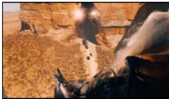
Figure 11: Digital Multitudes in Mad Max: Fury Road (2015)

Creative simulations are used in the scene to create the forces in the battle as they struggle for power. The scene shows Queen Sivagami wanting to see Baahubali's and Balla's strategy against the enemy of King Kalakeya. The most exciting scene shows Baahubali searching for a large cloth to burn the Kalayese army. While in Mad Max: Fury Road (2015), a digital multitude features in a scene of people who became slaves to Immortal Joe looking forward to water flowing from a dam (refer to Figure 11).