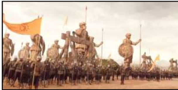
Figure 10: Digital Multitude in Baahubali: The Beginning (2015)

of thousands of digital beings. The use of digital multitude is cost-effective because creating a scene with many additional actors is very expensive. Digital multitude scenes were seen in Baahubali: The Beginning (2015) and Mad Max: Fury Road (2015). All the 'digital multitudes' in the films appear in scenes of war with a large number of armies and soldiers to symbolize strength and power. The most effective use of DVFX for a digital multitude is in Baahubali: The Beginning (2015) in Baahubali's battle of Balla, which attempted to defend the Mahashmati Kingdom from Kalakeya's attack (refer to Figure 10).