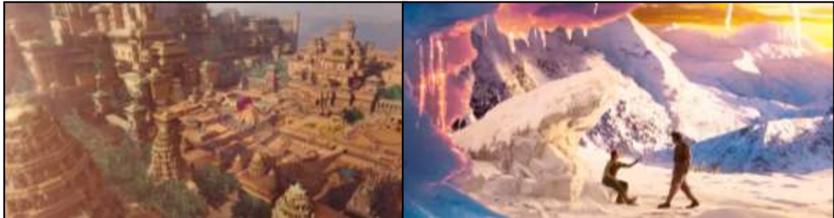
Figure 6: Setting for Baahubali: The Beginning (2015)

DVFx technology to create a place and time setting that fits the storyline. Several films use creative imagination to produce settings such as in historical films as well as sci-fi and drama films. From the analysis, the time and place setting in these films can be divided into two groups. The first uses historical periods such as empires of ancient times and the secondly is contemporary, modern and futuristic eras.