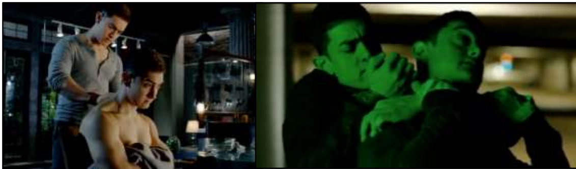
Figure 3: Sahir's and Samar's Characters in the Same Frame in Dhoom 3 (2014)

Bro's characteristics are also enhanced in digital form using DVFX primarily involving Super Bro's points of view. The futuristic interface technology element is used to show the sophistication of Super Bro as a high-tech robot in contrast to Cicakman. Additionally, DVFX is used for both of these characters during the action scenes. These action scenes will be discussed further in the next section.