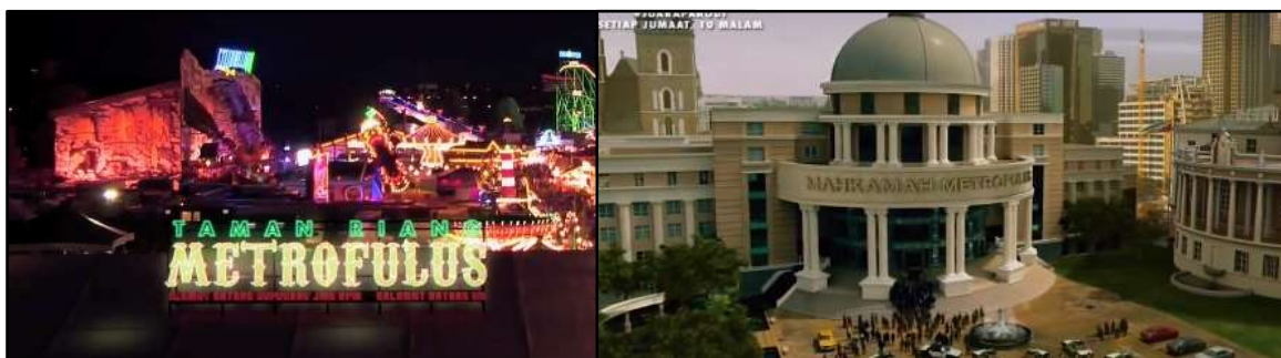
Figure 8: Background Setting of Metrofulus in Cicakman 3 (2015)

Films using modern and futuristic background settings are Seventh (2014), Mad Max: Fury Road (2015), Cicakman 3 (2015) and Dhoom 3 (2014). Cicakman 3 from Malaysia also uses DVFX to create the background setting of a fantasy country called Metrofulus. As seen in Figure 8, the production team uses DVFX technology to transform Putrajaya, the modern and advanced Malaysian administrative centre to Metrofulus City, a modern-day fantasy city whose architecture is influenced by European civilization. Examples of Metrofulus City settings in this movie include the court, police station, city centre, a theme park and a nightclub. In addition to using buildings in Putrajaya recreated with DVFX, the background of the movie also uses a circus fun park. The background location ‘ Taman Riang Metrofulus ’ (Metrofulus Fun Park) can be seen in the scene where Cicakman tries to save his wife and son who are Super Bro’s hostages. The use of DVFX in this movie to create the background settings are notable as most of the locations in this movie do not exist in the real world and needed great imagination and creativity from the creative team members.