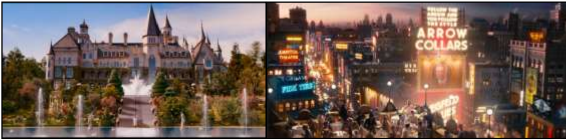
Figure 7: Setting for the Film The Great Gatsby (2013)

Films using modern and futuristic background settings are Seventh (2014), Mad Max: Fury Road (2015), Cicakman 3 (2015) and Dhoom 3 (2014). Cicakman 3 from Malaysia also uses DVFX to create the background setting of a fantasy country called Metrofulus. As seen in Figure 8, the production team uses DVFX technology to transform Putrajaya, the modern and advanced Malaysian administrative centre to Metrofulus City, a modern-day fantasy city whose architecture is influenced by European civilization. Examples of Metrofulus City settings in this movie include the court, police station, city centre, a theme park and a nightclub. In addition to using buildings in Putrajaya recreated with DVFX, the background of the movie also uses a circus fun park. The background location ‘ Taman Riang Metrofulus ’ (Metrofulus Fun Park) can be seen in the scene where Cicakman tries to save his wife and son who are Super Bro’s hostages. The use of DVFX in this movie to create the background settings are notable as most of the locations in this movie do not exist in the real world and needed great imagination and creativity from the creative team members.