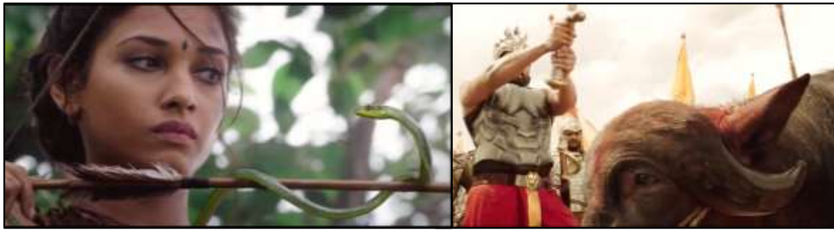
Figure 4: Animal Creatures in Baahubali: The Beginning (2015)

In the Australian film productions, the use of DVFX for character creation is a feature of Mad Max: Fury Road (2015). In this movie, the commander Imperator Furiosa, played by Charlize Theron, has no left hand and uses a mechanical robotic hand. There is a scene showing War Boys attacking Furiosa when she is stranded in the desert after taking an oil tanker to Gas Town on the orders of Immortan Joe. In the scene, Furiosa is standing in the desert clearly showing her hands and the scenes were produced using DVFX. There was also a scene showing Furiosa having a metal prosthesis in place of her left hand. DVFX is also used to create a creature. In the opening act of the film, a man appears on a hill and is watching something. A lizard (computer-generated image) appears behind the man and he eats the lizard ravenously. The Great Gatsby (2013) have no assisted or DVFX characters and DVFX are primarily used in other visual creations such as backgrounds and settings.