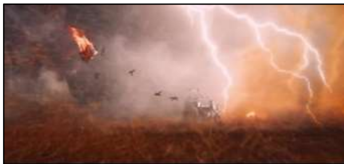
Figure 12: Sandstorm Simulation in Mad Max: Fury Road (Australia, 2015)

Productions from all three countries use DVFX well for creative simulations. The Australian productions, in particular, demonstrate more realistic and convincing simulations primarily in the creation of natural disasters. This is evident in the three Australian films, which creatively use creative simulations for scenes involving nature such as sandstorms in Mad Max: Fury Road (2015). In this movie, when Max and Furiosa escape from the War Boys, DVFX creative simulation is used to create a sandstorm in the desert and lightning strikes. The same quality is also shown at the start of the film when there is a scene showing a dark area destroying the trees growing in the area. The condition has caused the area to become a desert. The vehicles pursuits and explosions in the film are much better than in the other films and the film lifts the narrative basis of the action genre.