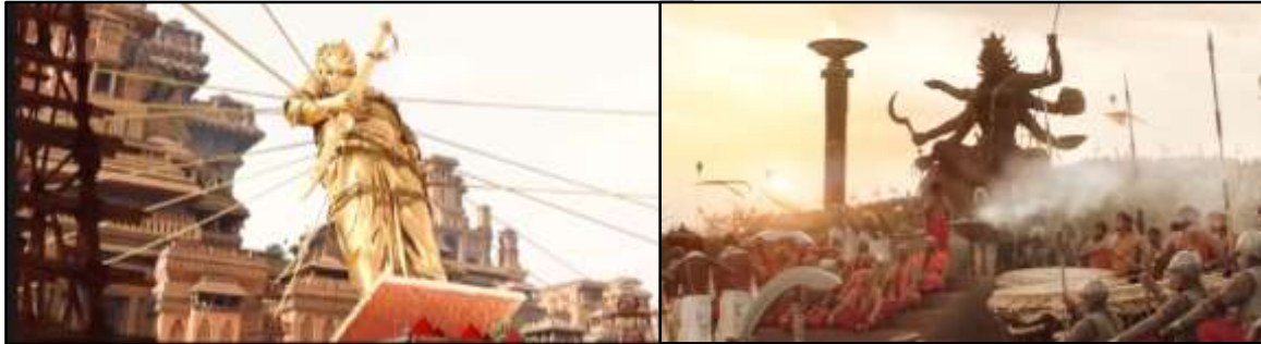
Figure 9: Sculptures in Baahubali: The Beginning (2015)

taken to the battlefield are symbolic of the splendour and majesty of the Kingdom of Mahashmati. Therefore, the sculptures created in the film symbolize the power and strength of Balla's character and the Kingdom of Mahashmati. It also shows that digitally created objects can have particular meanings and may be indirectly required by the narrative to develop the storyline and characters.