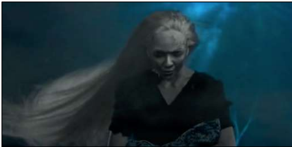
Figure 1: Ghost Character Ying in Seventh (2014), Entirely Produced Using CGI Technology

The use of DVFX to create characters for films in Malaysia is particularly suitable for Seventh and Cicakman 3 . In Seventh (2014), CGI is used to transform the characters of the old folks' house ghost spirits in most scenes using DVFX. Based on an analysis of 36 scenes using DVFX, 24 scenes feature the appearance of a digital ghost spirit character or creatures with a variety of looks. As Seventh is a horror and comedy genre movie, there are several instances of emerging spirits inserted with comedy elements such as an old man's spirit looking for his fallen eyebrows after a loud sneeze and a scene where Mimi brushes the hair of an old lady's spirit until that woman no longer has a scalp. There is also a scene where a character's hand is extended, and most of the resulting souls have no eyes. The main character, Ying, was also featured in a wholly digitalized ghost look in the scene where Yee manages to unravel the true tale of Ying.