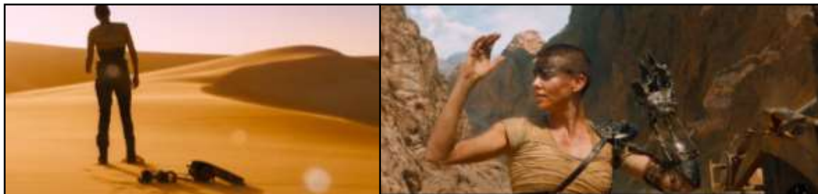
Figure 5: Furiosa in Mad Max: Fury Road (2015)

In the Australian film productions, the use of DVFX for character creation is a feature of Mad Max: Fury Road (2015). In this movie, the commander Imperator Furiosa, played by Charlize Theron, has no left hand and uses a mechanical robotic hand. There is a scene showing War Boys attacking Furiosa when she is stranded in the desert after taking an oil tanker to Gas Town on the orders of Immortan Joe. In the scene, Furiosa is standing in the desert clearly showing her hands and the scenes were produced using DVFX. There was also a scene showing Furiosa having a metal prosthesis in place of her left hand. DVFX is also used to create a creature. In the opening act of the film, a man appears on a hill and is watching something. A lizard (computer-generated image) appears behind the man and he eats the lizard ravenously. The Great Gatsby (2013) have no assisted or DVFX characters and DVFX are primarily used in other visual creations such as backgrounds and settings.