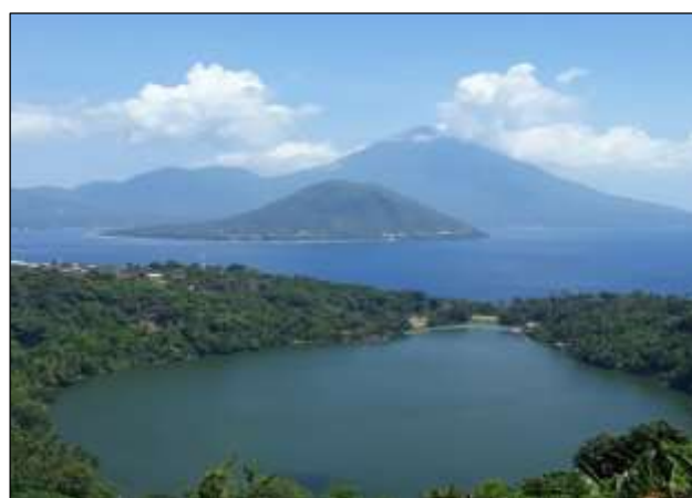
Figure 2: Scenery of Fhitu, Ternate

According to the Ternate City Development Planning Agency (BAPPEDA) (2012), the city of Ternate is located between 3 degrees Northern Latitude and 3 degrees Southern Latitude and 124 - 129 degrees Eastern Longitude. Ternate City borders the Maluku Sea in the north, south and west, and the Halmahera Strait in the east. As an Island City, Ternate consists of 8 (eight) islands, namely: five inhabited islands of Ternate as the main island, Hiri, Moti, Mayau, and Tifure, and three small uninhabited islands of Maka, Mano and Gurida. The territory of Ternate City covers 5,795.4 km 2 , consisting of 5,544.55 km 2 of waters and 250.85 km 2 of land.