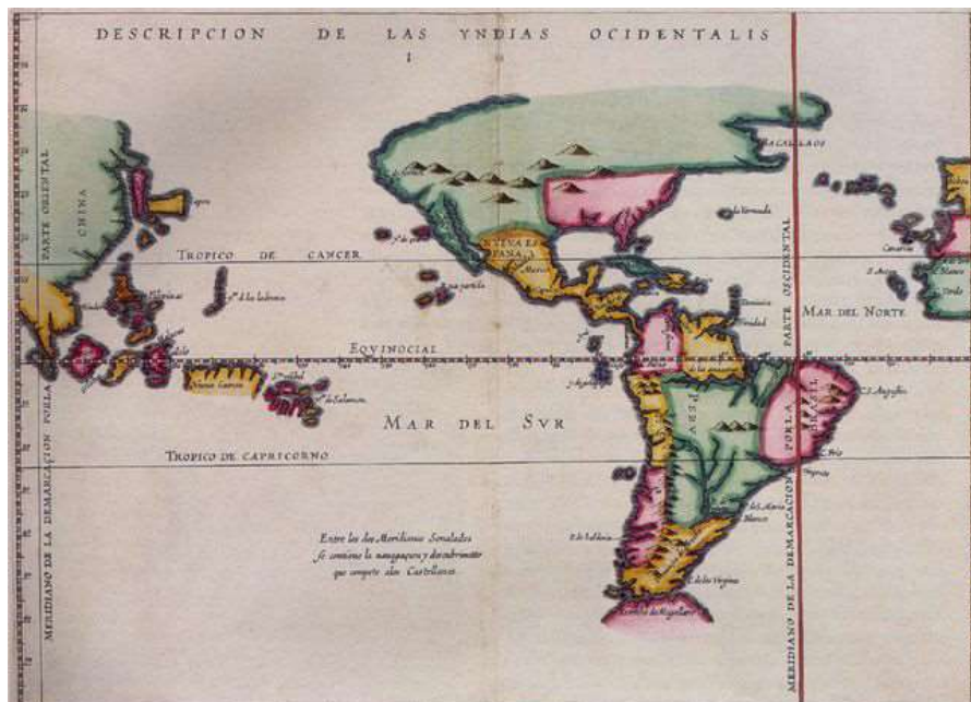
Figure 1: The Treaty of Tordesillas

and spread of religion) among Europeans so that the Tordesillas Treaty (1494) was born. This agreement divides the two spheres of the Earth in the interest of Spanish and Portuguese powers.