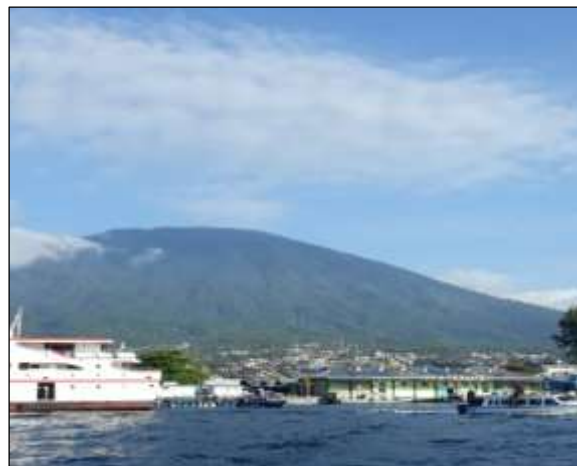
Figure 3: Bastiong Port (source: Personal Documentation)

The kingdom of Ternate played an important role in the North Maluku region until the 17th century. In the historical records of the Sultanate of Ternate or also defended with the Kingdom of Gapi, is one of the oldest and very influential kingdoms in the archipelago. Ternate has been visited by foreign traders such as those from China, Arabia and Gujarat, as well as those from the archipelago such as Java, Malacca, and Makassar. Ternate developed into the largest and main trading port in Maluku. Trade between nations at that time was centered at the port of Talangame, currently known as the port of Bastiong. Ternate already has a market with adequate facilities, where local traders, foreign traders and domestic traders meet (Rusdiyanto, 2018).