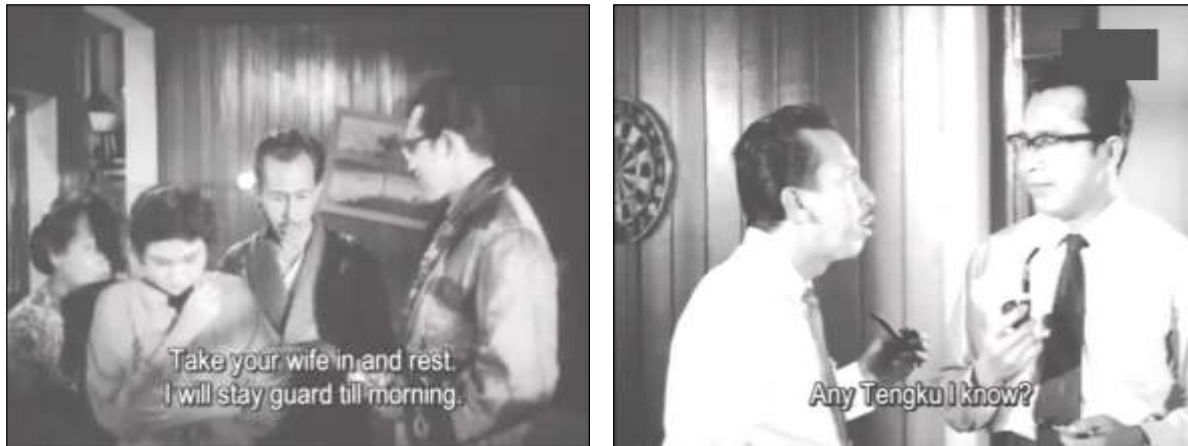
Figure 8: Synchronic medium shots of Ungku Aziz

dominant trait was his liberal mind, which required tighter shots to emphasize his wisdom rather than that of his tall stature.