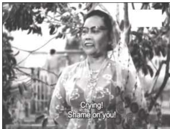
Figure 7: Synchronic medium shot of Nyonya Mansoor in Ibu Mertua-Ku

In another example of character as a carrier to interior meaning, the director stylistically framed Antara Dua Darjat 's Ungku Aziz in a synchronic medium shot. A different approach to the way other aristocrat men like Tengku Karim and Tengku Hassan were mostly framed, in American or full shot. This distinguishable difference can be explained through the function of body language and men's physical dominance. The Tengku's were mostly framed looser to show their authoritative and intimidating gestures, while as for Ungku Aziz his most