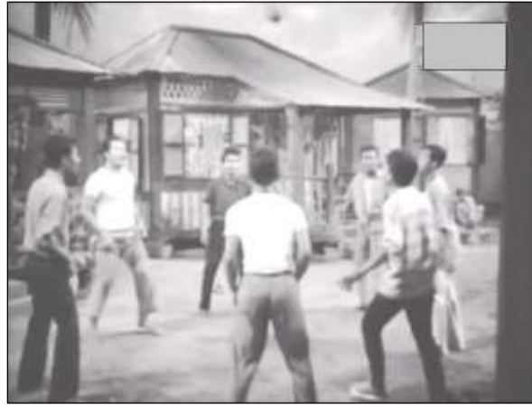
Figure 2: Communal space framed in long shots in Antara Dua Darjat

focal length lenses very commonly used in the early Malayan film industry. One of which was the communal scenes in both Antara Dua Darjat and Ibu Mertua-Ku . To be able to frame actions smoothly with multiple actions simultaneously happening at the same time in-frame requires a director to be technically competent and capable of directing big casts.