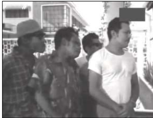
Figure 12: Synchronic medium shot of the brothers in Ibu Mertua-Ku

The study on P. Ramlee's auteurship in devising cultural representation through visual narrative cinematography tools in sum managed to uncover the director's cinematographic style, how he represented cultural values and how he fulfilled auteur characteristic in doing so. The findings saw P. Ramlee's aptitude in employing synchronic and diachronic shots with motivations. Shots were constructed with proper planning as every element in frame served a purpose. Though compared to cinematic film such as Semerah Padi , diachronic shots were employed sparingly in both Antara Dua Darjat and Ibu Mertua-Ku . However, those restrictions did not prohibit P. Ramlee from fully utilizing pan and tilt as important framing elements. The distinctively unique choice of synchronic and diachronic shots employed also demonstrates P. Ramlee's consistency and prowess in the art of visual narrative. In representing cultural values P. Ramlee was careful to be subtle and to not meddle with the core narrative. The findings suggest that in portraying cultural values of communal, brotherhood, responsibility and manners, P. Ramlee was consistent in devising distinguishable cinematography style. With keen eyes, these cultural values can easily be identified by not only researchers and critics but also by everyday audiences.