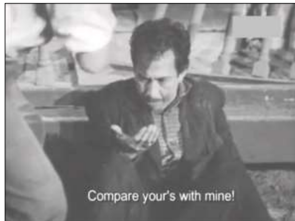
Figure 4: Synchronic high angle of Ungku Mukri