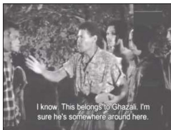
Figure 11: Synchronic medium shot of the brothers in Antara Dua Darjat

The representations of brotherhood as societal values were comparable in both Antara Dua Darjat and Ibu Mertua-Ku . The men were mostly framed in synchronic medium and at times full shot, a choice of framing the director employed to permit all “brothers” visibly composed in a frame. Figures 11 and 12 are two visual narrative instances of brotherhood representation in intense situations. In Figure 11, the men were gathered to search for Ghazali who was beaten by the Tengku’s goons, while in Figure 12, Kassim Selamat was accompanied by his band members when he was summoned by Nyonya Mansoor. The tightly framed medium shots portrayed the strong bond of brotherhood among these men, a recurring style identifiable throughout the films.