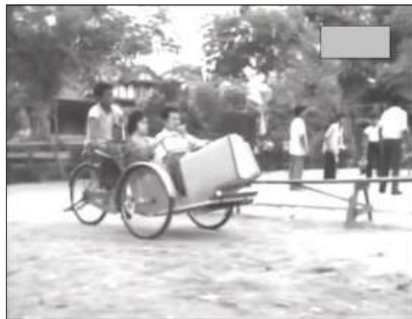
Figure 3: Communal space framed in long shots in Ibu Mertua-Ku

Figures 4 and 5 portray P. Ramlee's idiosyncrasy in utilizing conventional film syntax in emphasizing his storytelling. The final confrontation scene of aristocrat and commoner in Antara Dua Darjat , Ungku Mukri was shot at a high angle not only as a point of view of Ghazali (standing) but also a statement made by the director. The notion was meant to criticize the Malay society's obsessions towards status, inheritance, and title. Referring to Figure 5, in a scene of Ibu Mertua-Ku , after marrying Kassim Selamat and Sabariah off Nyonya Mansoor announces to the gathered party that Sabariah is no longer her daughter. The position of the newlyweds on the floor permitted a point of view shot such as the frame below. However, this low angle shot also portrayed the power and authority of Nyonya Mansoor. This choice of angle on framing Nyonya Mansoor can be seen utilized by P. Ramlee throughout the film.