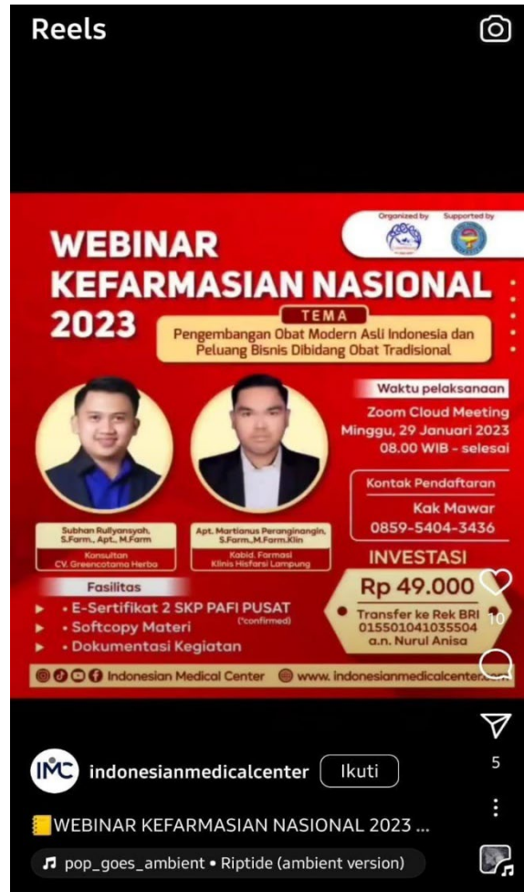
Figure 3: The National Pharmaceutical webinar event

This webinar can provide a competitive advantage in digital marketing strategies. The event can potentially draw interest from a particular target audience, including academicians, pharmaceutical corporations, healthcare professionals, and practitioners of traditional medicine if it has a compelling theme. Participants are likely to be more receptive to messages and promotions sent through digital marketing tactics if they are interested in the topics of creating unique contemporary medications and business opportunities in the field of traditional medicine. Attendees can engage in interactive interactions with speakers and other attendees during Q&A sessions, panel discussions, and sharing sessions. This gives digital marketing tactics the chance to employ social media promotion, hash-tagging, and content sharing to broaden their audience, create buzz, and raise participant involvement.