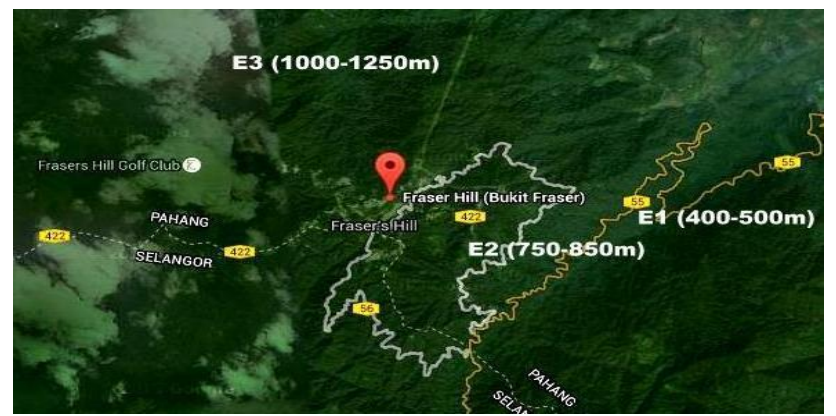
Figure 1 Map of Fraser's Hill

Within this study site, the diversity of butterflies was studied at three altitudes, i.e. 400-500 m (E1), 750-850 m (E2), and 1000-1250 m (E3).