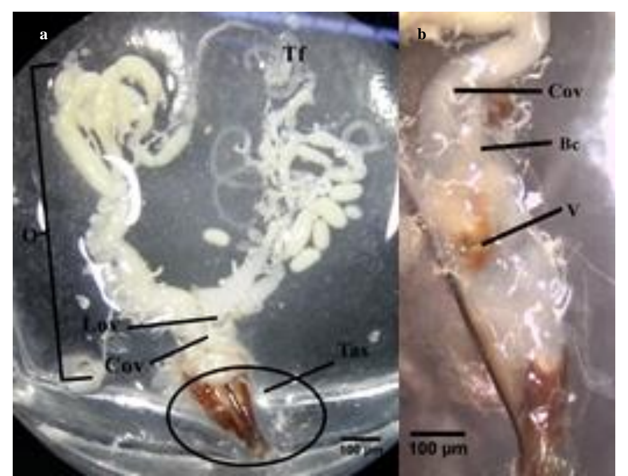
Figure 1 Ex-situ of female reproductive system of red palm weevil, Rhynchophorus ferrugineus . (a) Morphology of female RPW reproductive organ, (b) Terminal abdominal sterna. Tf: terminal filament, O: paired of ovaries, Lov: lateral oviduct, Cov: Common oviduct, Tas: Terminal abdominal sterna, Bc: Bursa copulatrix, V: Vagina.