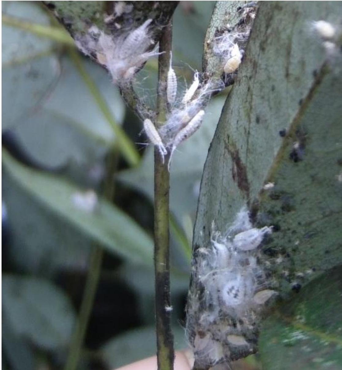
Figure 2. Nymphs and adults of Ferrisa dasyliirii (Cockerell) on the leaf lower surface of Gliricidia sepium (Jacq.) (Fabaceae)

In nature, F. dasyliirii (Figure 3A) is mostly similar to F. virgata in form and size. The species has eight segments antennae with \geq 595 \mu\text{m} long; elongate body oval with 3.10–5.30 mm long and 1.30–2.86 mm wide (Figure 3B) observed the bodies of females cleared of soft contents and the cuticles stained and mounted on microscope slides. They could be easily distinguished from other taxa by their discoidal pores associated with the sclerotized area around the rim of dorsal enlarged tubular ducts on the abdomen. Discoidal pores are situated on the sclerotized area's outer margin and often with pore and its surrounding sclerotization projecting out from the margin (Figures 3C- D).