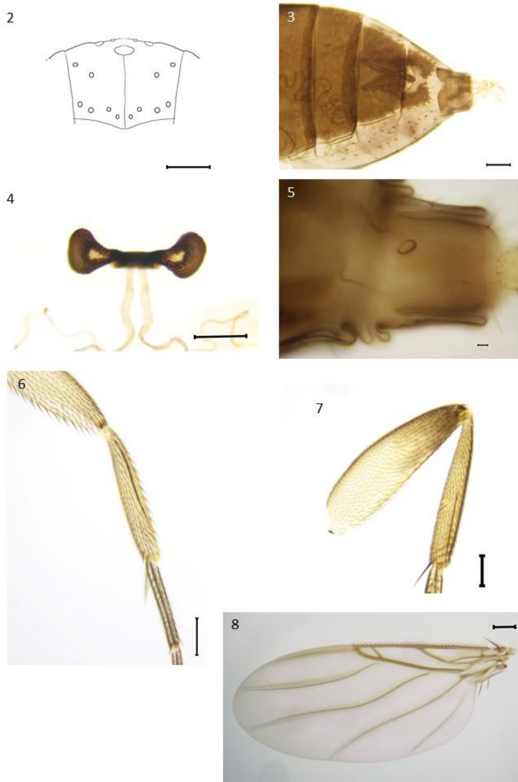
Figure 2-8. Woodiphora sp. D female. 2, frons; 3, abdominal tergites 5-7; 4, Dufour's crop mechanism; 5, internal sternite 9 (furca); 6, mid tibia; 7, hind femur and tibia; 8, left wing (Scale bar = 0.1 mm, except 5, scale bar = 0.01 mm).