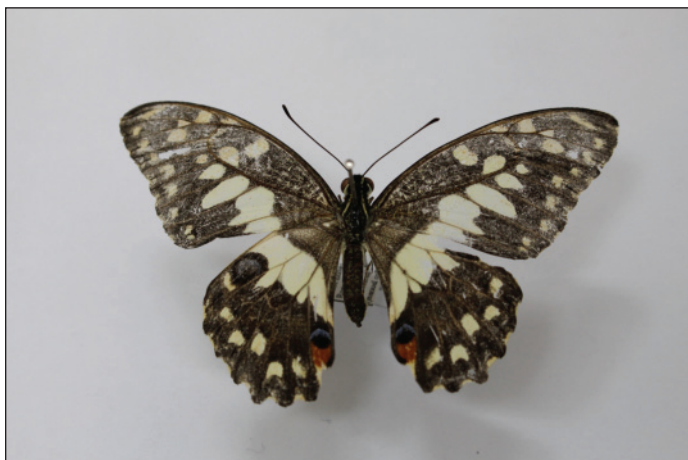
Fig. 2. Papilio demoleus malayanus Wallace, 1865. This species was caught when feeding nectar on flower of Ixora sp. at NERC during a bright sunny day.