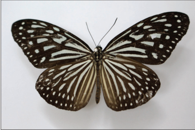
Fig. 3. Ideopsis similis persimilis (Moore, 1879). Two specimens were collected in the area of NERC. This species was found fluttering in the open space/logging track.