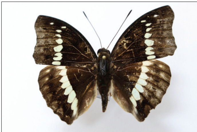
Fig. 1. Sumalia agneya (Doherty, 1891). Five specimens were collected using trap baited with over-ripe banana, hung at a dipterocarp tree. The sampling site is along the Sungai Semawak trail at 93 m.