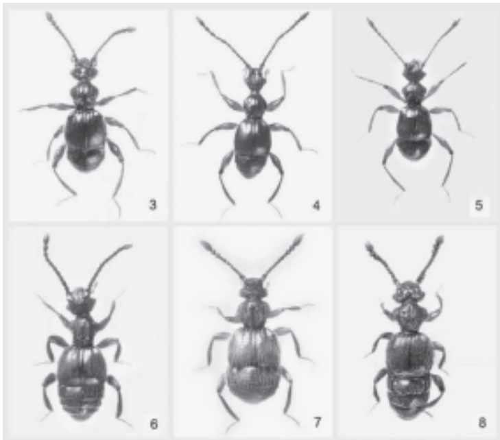
Figs. 3-8. 3, Batrisodes ? sp. 1, female; 4, Gen. undet. 1, sp. 1, male; 5, Tribasodes ? sp. 1, male.; 6, Batriplica sp., male; 7, Hypochraeus sp. 1, female; 8, Batrisoschema sp., male.