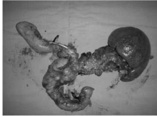
Fig 1: En bloc resection including the spleen, pancreas, duodenum and the gallbladder

Diffuse morphology of pancreatic ductal adenocarcinoma is an unusual manifestation that represents only about 5% of all cases of pancreatic adenocarcinoma (1). To date, there is no pathologic definition to describe diffuse pancreatic adenocarcinoma. However, an earlier study defined diffuse disease by the involvement of a tumour of more than 50% along the longitudinal axis of the gland (2). The evolution of diffuse pancreatic adenocarcinoma is still debatable. While some believe that it is a result of rapid progression of an aggressive focal tumour others think that this may simply be attributed to a delayed diagnosis. The third postulation is a synchronous multifocal development of cancer thus exhibiting a diffuse involvement of the gland. Extreme elevations of CA 19-9 levels has been demonstrated in patients with diffuse pancreatic adenocarcinoma (3). This has been postulated as due to the increased tumour burden in a diffusely involved gland as opposed to a focal lesion. However, the marked elevation of this enzyme by itself is inadequate to diagnose diffuse adenocarcinoma