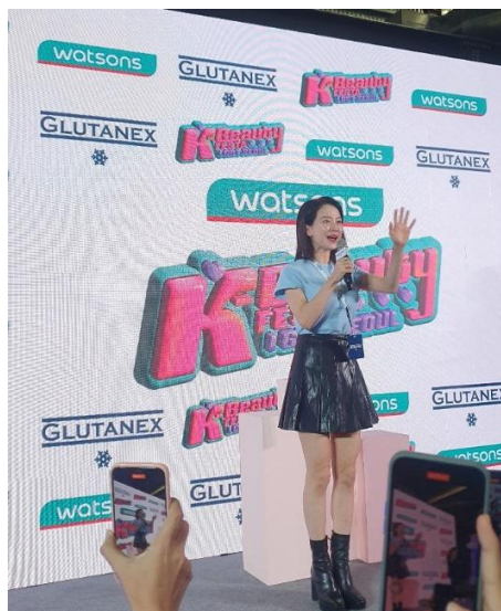
Figure 3: Song JiHyo as Glutanex ambassador For Watson KBeauty Fiesta

The actor, Song JiHyo, comprehensively uses her social media accounts to post about her time in Kuala Lumpur during the two days she was here. Not only did she attend the event and meet with fans, but she also influenced them to purchase the products available. She would participate in sessions with attendees, interacting with attendees by talking to them about their skincare routines and how she uses the products. She also gave the fans a rare opportunity to have close proximity interaction. While the organizer's common objective was to generate sales, the attendees were also able to create lasting memories and connections with her. Additionally, the event organizer combined Watson's official social media posts with the celebrity's posts about the event, which generated substantial engagement such as likes, shares and comments. As a result, attendees at the event and at home were exposed to various brands and their products, leading to a significant increase in brand awareness, engagement and product sales both during and after the events.