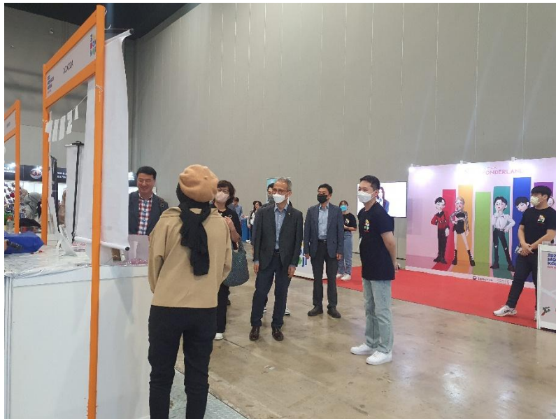
Figure 2: Ambassador-Designate of the Republic of Korea to Malaysia, Yeo Seung-Bae Attended One of the Booth.

and finding alternative structures, processes and content that better align with the demands and dynamics of the media landscape and the Korean Wave fans.